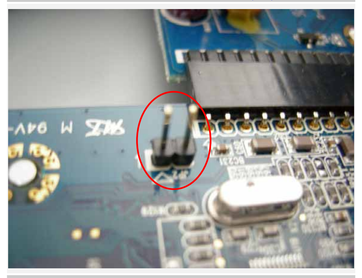
4. Connect the two jumps(pins) to form a short circuit. Then plug in the power and hold the short circuit for more than 10 seconds.